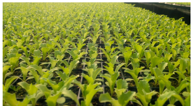
Consistent uniformity leading to optimal sowability